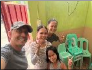
Students at the school

meeting of 20+, hosting a Work is Worship conference